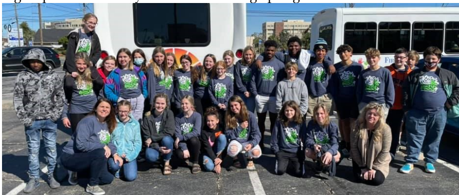
Winter Retreat 2021

We will not have youth group on Wednesday March 17th during Spring Break!