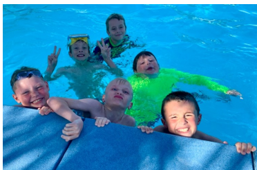
Splashing into summer at the pool party