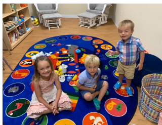
Nursery is available on Sunday mornings