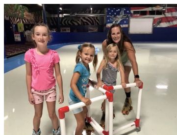
WACKY WEDNESDAY TRIPS