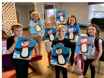
Children's Winter Paint Party