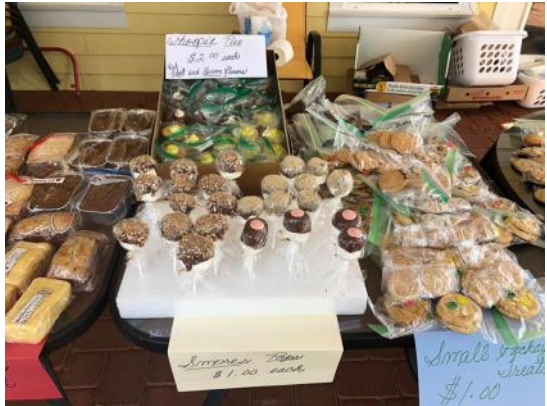
Annual Methodist Men's Butts on the Bay BBQ Cook-off & Methodist Women's Bake Sale