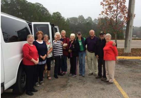
Annual UMCOR Mission Trip

Come grow with us! There's something here for everyone!