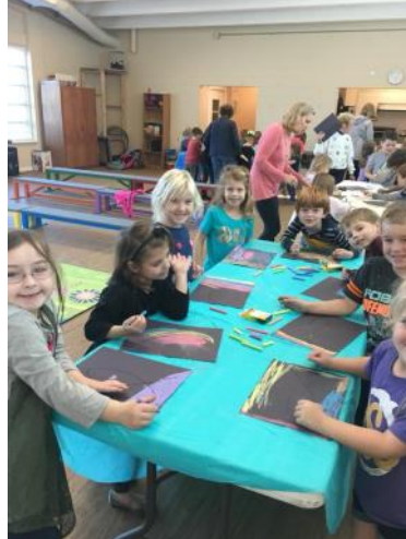
Children's Ministry Volunteer