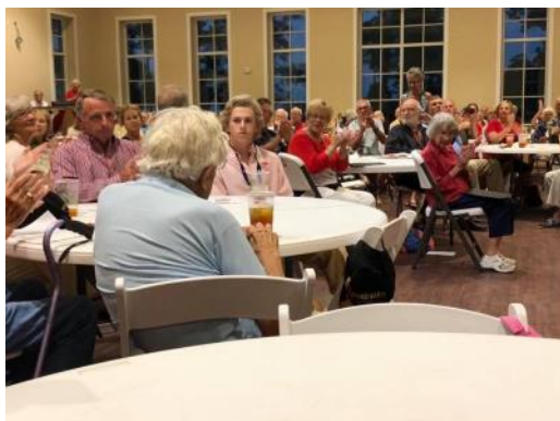
Wednesday Night Dinner and Pastor's Bible Study

*For more information about any of these activities, please contact the church office.