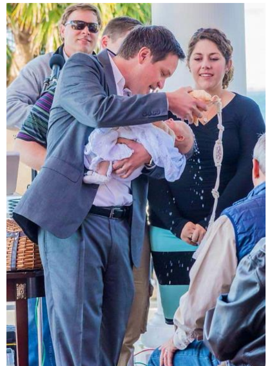
The Dooley Family