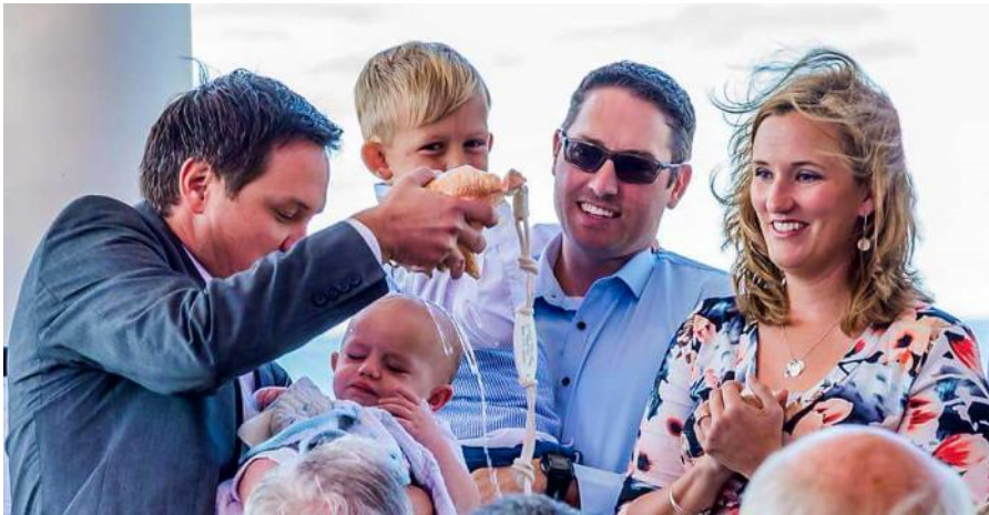
The Matney Family