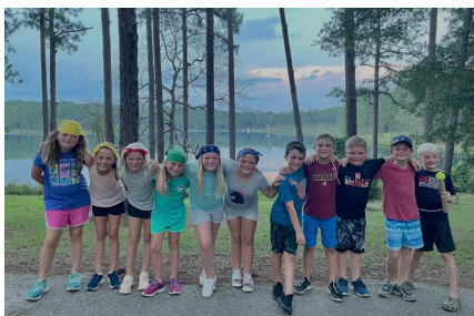
Third and fourth graders at Blue Lake Summer Camp

Little Lambs (preK3-1 st grade) and Kids Life (2 nd -5 th grade) begins Wednesday, August 18, 5:30-7:00 at the Methodist Learning Center, 218 Long Avenue. Dinner is $3.