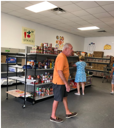
Two Fish Volunteers