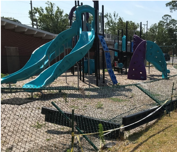
Photo 7: Distorted, torn, and saltwater-compromised playground set on 052819.