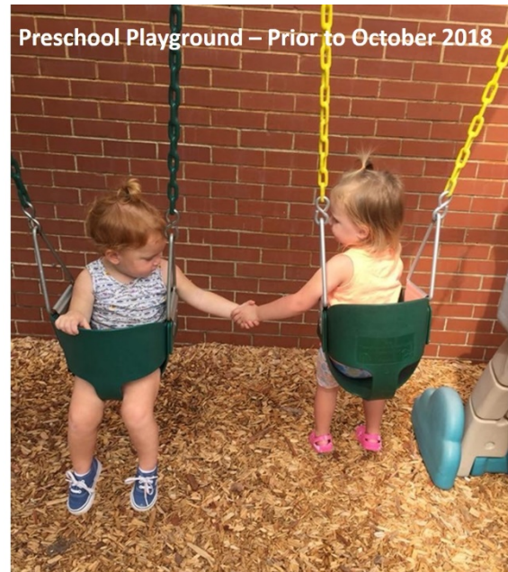
Photo 4: Preschool playground swing set prior to Hurricane Michael.