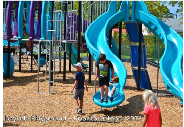
Photo 5: Elementary playground swing set prior to Hurricane Michael.