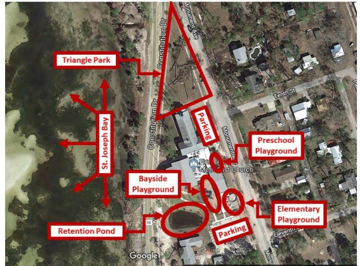
Photo 8: Google Maps Satellite View of selected FUMC campus features (see red ovals and arrows).