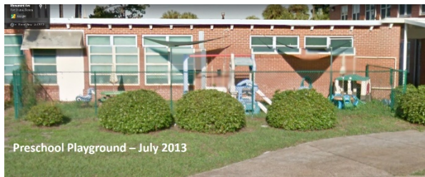
Photo 3: Preschool playground features per Google Street View dated July 2013.