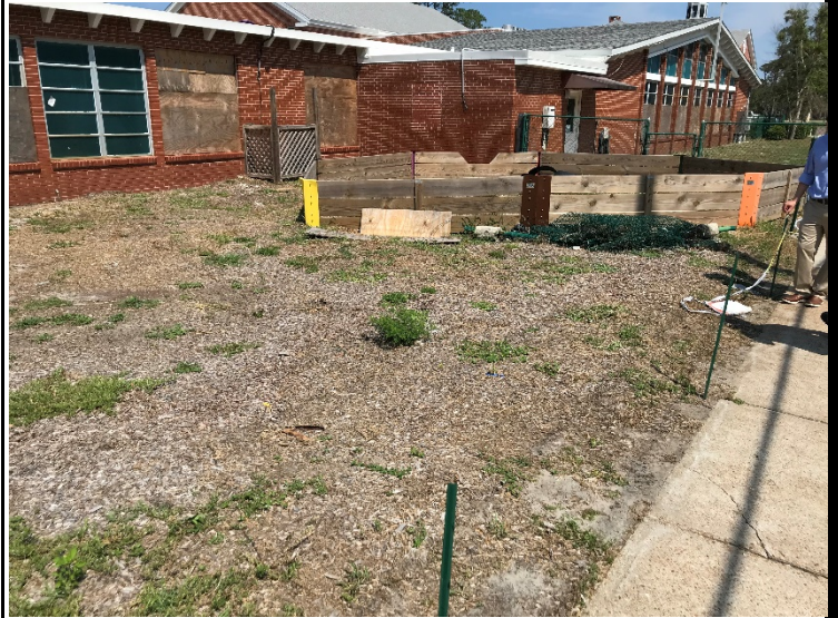
Photo 5: Elementary Playground condition (northern end) in hurricane's aftermath per Oct 2018 Google Street View.