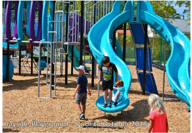
Photo 1: Location of Bayside (Bayview) Playground relative to FUMC facility. Refer to SIR for Lat/Long (typ).