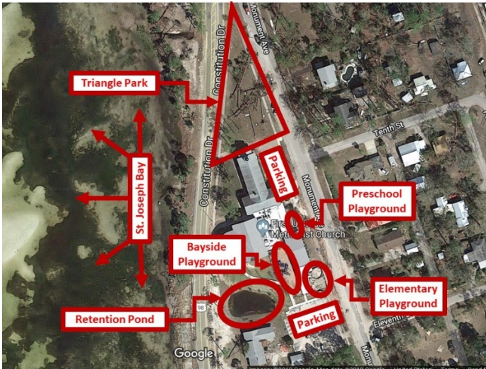
Photo 7: Google Maps satellite view of selected FUMC campus features (see red ovals and arrows).