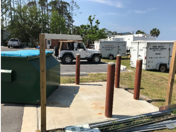
Photo 5: Wood posts at location of former dumpster enclosure fence.