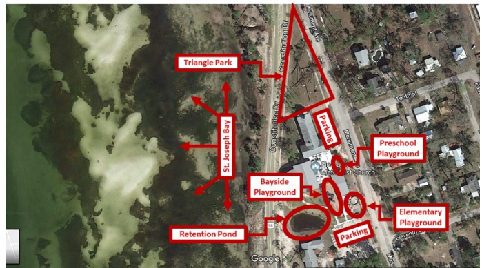
Photo 8: Google Maps satellite view of selected FUMC campus features (see red ovals and arrows).