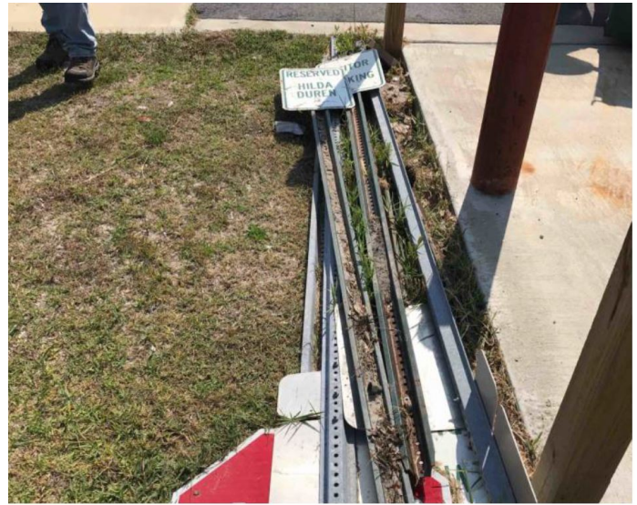
Photo 6: Damaged signage awaiting re-installation - stockpiled near southern parking lot.