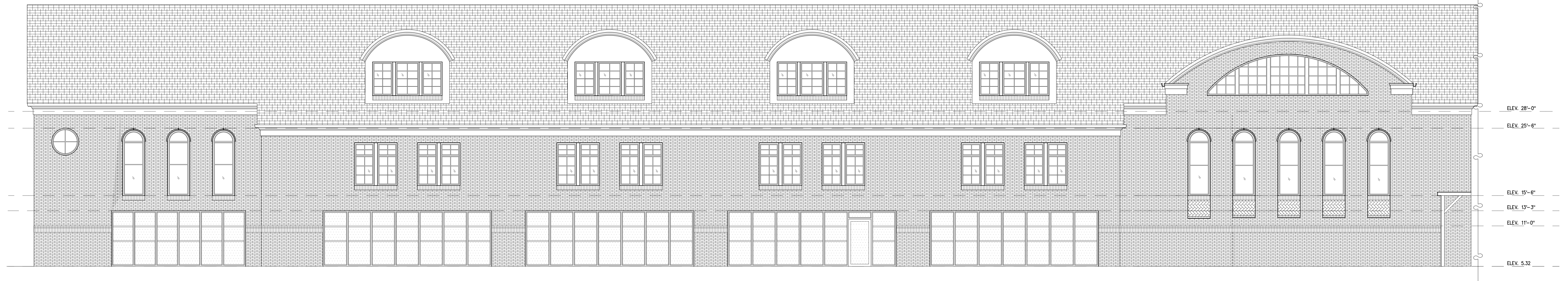
1 A2.4 Partial West Elevation