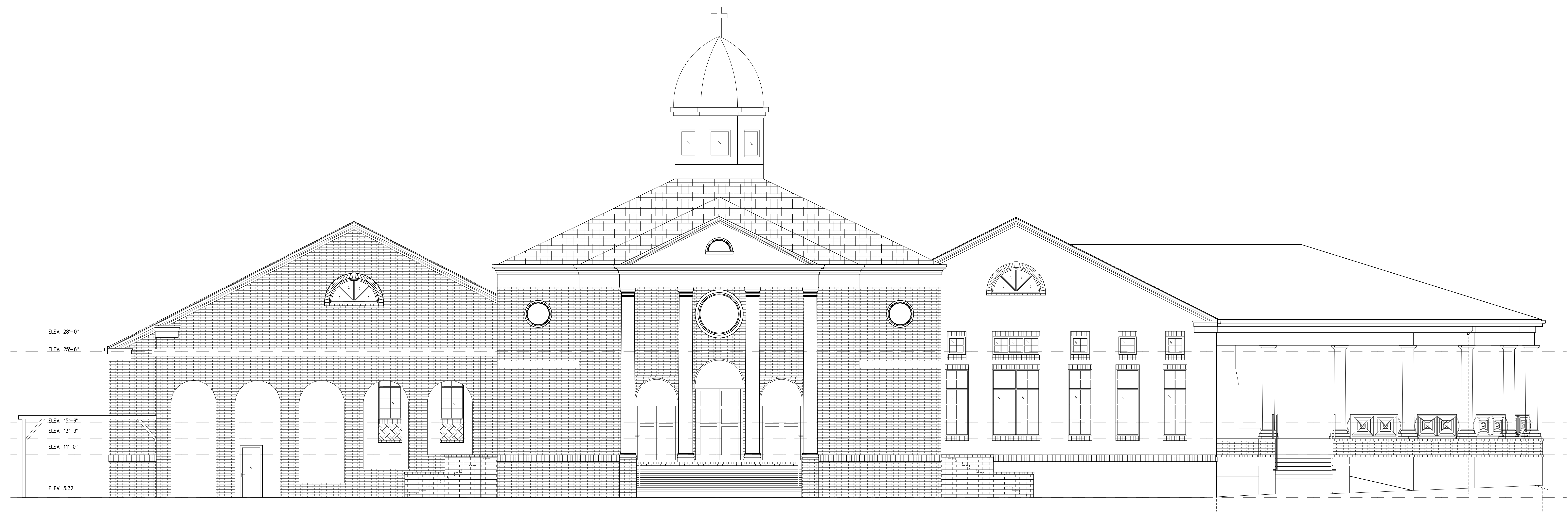
1 North Elevation 3/16" = 1'-0"